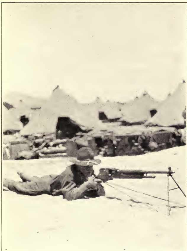
THE AUTHOR, WITH A MACHINE GUN